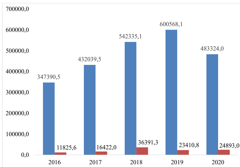
Figure 2. Dynamics of capital investments in Ukraine by tangible and intangible assets for 2016–2020, million UAH

Investments in tangible assets include investments in residential and non-residential buildings, engineering structures, machinery, equipment and inventory, vehicles, land, long-term