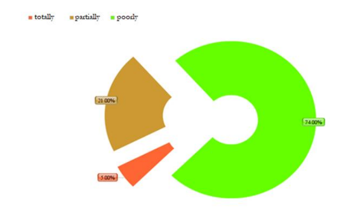
Figure 1. Distribution of answers to the question "Does the educational institution prepare students for life in modern socio-economic conditions?"

At the same time, as the results of the survey show, teachers are not inclined to blame themselves for this situation (table 2). In the first place, they put the general crisis of the educational system.