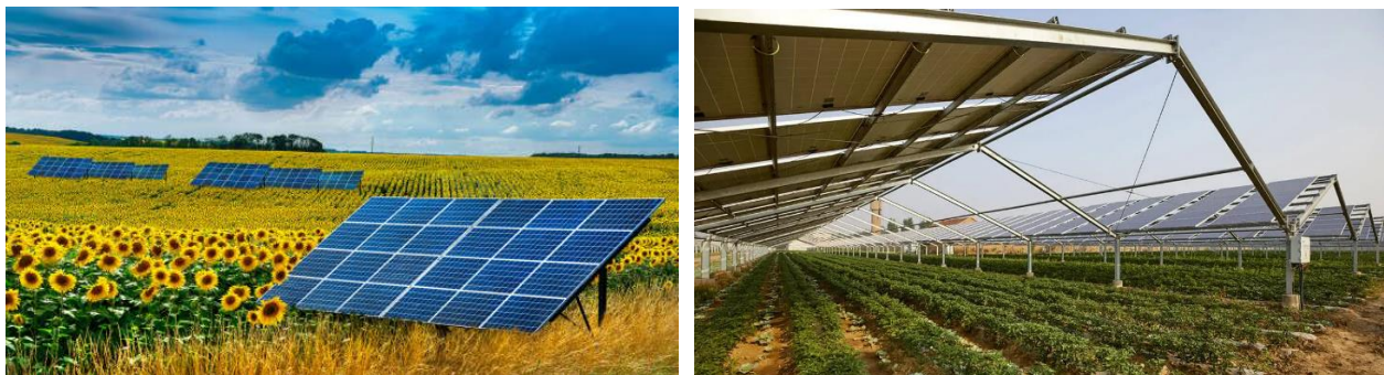
Fig. 2. Example of dual use of a solar panel with a sunflower field in agriculture on land plots

Solar stations can be installed on cultivated fields, which allows for optimizing land use and increasing crop yields. Partial shading of fields promotes the improved growth of certain crops and provides dual cooling, as illustrated in Figure 2. Plants under the protection of panels can absorb more carbon dioxide for photosynthesis; leaves evaporate moisture, leading to the creation of a more comfortable microclimate. This accelerates plant growth and contributes to the cooling of the solar modules themselves, further reducing energy losses [8].